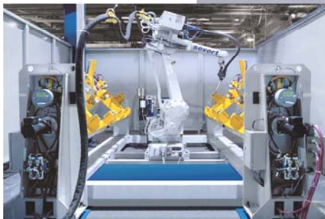
production lines with different robot systems