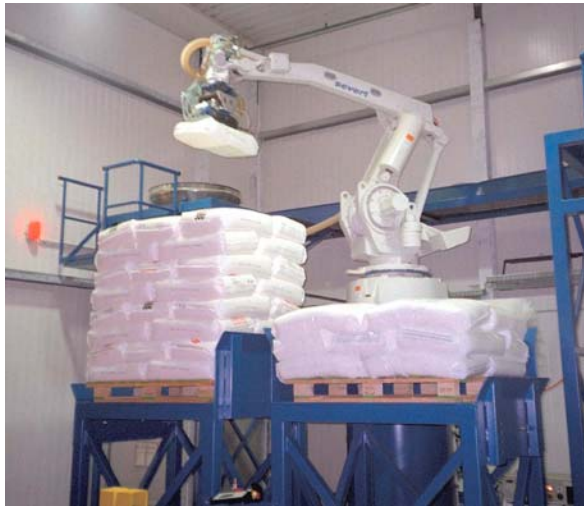
Handling robots for depalletization and emptying of plastic granulate